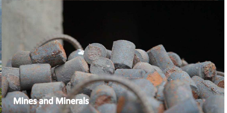
Mines and Minerals